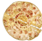
4. The Cenedese Museum of Vittorio Veneto