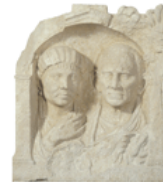
6. The Civic Museum of Oderzo

North of Opitergium, were located respectively close to the Asolo hills and at the mouth of the Piave valley.