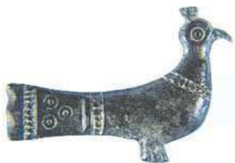
5. The Civic Museum of Oderzo