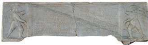
12. The Church of Sant'Eulalia (adjacent room)