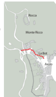
13. The course of the Bot

It means the "underground water duct" and represents a very technically advanced product. Origins of its name lie in the most ancient past of our language and its remains are still visible in Asolo,