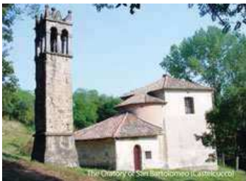
The Oratory of San Bartolomeo (Castelfranco)

With its simple rectangular shaped structure, the truss roof and the semi-circular apse, the small oratory of San Bartolomeo,