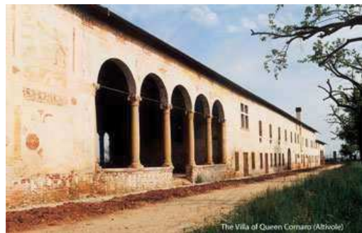
The Villa of Queen Cornaro (Altivole)

There was... in a spacious area of the building of Asolo, an ancient villa, half a mile long on each side, fenced in by a continuous wall". An area of pleasure, an agricultural centre and a protection system, it combined a whole range of architectures, loggias, rooms, apartments with heated rooms, hydraulic structures, a fishing area, a dove cote, botanical gardens and flower gardens... From Historia di Trevigi, Giovanni Bonifacio (1547-1635)