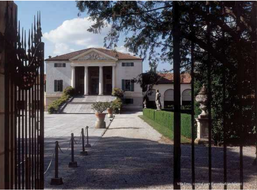
Villa Emo - central part (Fanzolo di Veduggio)

Villas, religious buildings, factories and districts constitute a cultural, historical and artistic patrimony waiting to be revealed. Eight historical periods create the excuse for a step-by-step course aimed at discovering and analysing our architectural patrimony. In the area between the Pedemontana del Grappa and Castelfranco Veneto, there is a chain of internationally famous architectural works of art, that cover more than 1,000 years of history.